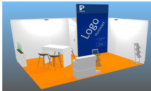
Visualization. Actual stand similar

Deadline: 30.04.2021 plus 25 % surcharge for orders received after 01.05.2021